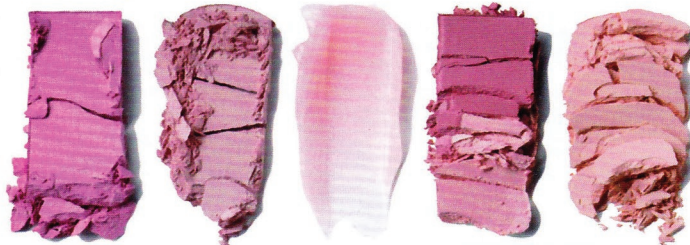
From left Blush in Pale Pink £16.50 Bobbibrwn.co.uk; Blush in Pink Pebble £8.05 Beautycycle.co.uk; Instant Blush Magic Colour £16.50 Clarins.com; Blush Variation in Rose Whisper £27 Yves Saint Laurent; Blusher in Pink £24.95 Theorganicpharmacy.com