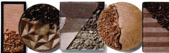
From left Illuminizing Satin Eye Colour in Squirrel £20 Shiseido; Studio Secrets Professional Blue Eyes Intensifier £5.99 L'Oréal Paris; Colour Intense Trio Eyeshadow in Cookie Dough £2.99 Collection2000.co.uk; Gosh Glamorous Eyeshadow in Copper £6 Superdrug.com; Luxurious Color Satin Eyeshadow in Shimmering Sienna £4.99 Revlon