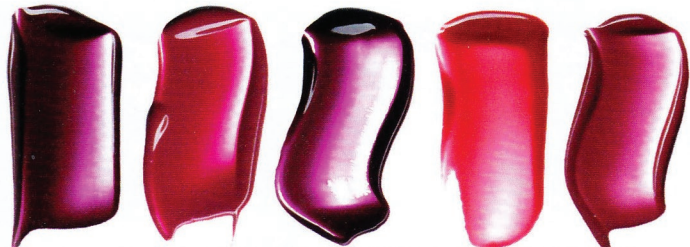
From left Ultra-Gloss Flash in Black-Tie Plum £18 Dior Addict; Limited Edition Strawberry Fields Lip Gloss £17 Narscosmetics.co.uk*; Lip Ink in 1 £19 Giorgio Armani**; Lip Smoothie in Pome-greatness £13.50 Clinique.co.uk*; KissKiss Essence De Gloss in Violette £19 Guerlain* ▶