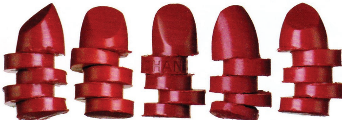
From left Cremesheen in Brave Red £12.50 Maccosmetics.co.uk; Color Fever in Red and Sensual Java £18.50 Lancome.co.uk; Rouge Coco in Paris £21.50 Chanel; Lipstick in Faust £15 Illamasqua.co.uk; Signature Hydra Lustre in Rich Red £17.50 Estelauder.co.uk