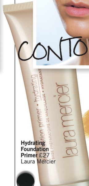
Hydrating Foundation Primer £27 Laura Mercier