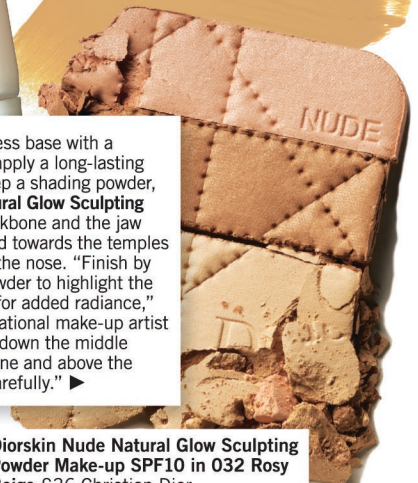
Diorskin Nude Natural Glow Sculpting Powder Make-up SPF10 in 032 Rosy Beige £36 Christian Dior

HOW TO Create a flawless base with a hydrating primer, then apply a long-lasting matte foundation. Sweep a shading powder, like Diorskin Nude Natural Glow Sculpting Powder , below the cheekbone and the jaw line, across the forehead towards the temples and down each side of the nose. "Finish by using the pink nude powder to highlight the high points of the face for added radiance," says Jamie Coombes, national make-up artist for Dior. "Lightly brush down the middle of the nose, the browbone and above the cheekbone, blending carefully." ►