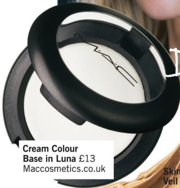
Cream Colour Base in Luna £13 Maccosmetics.co.uk