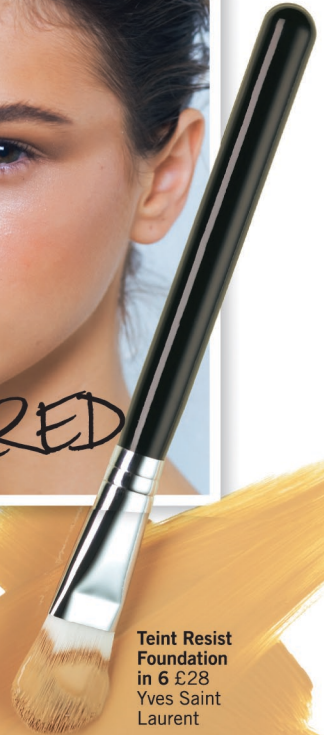
Teint Resist Foundation in 6 £28 Yves Saint Laurent

HOW TO Create a flawless base with a hydrating primer, then apply a long-lasting matte foundation. Sweep a shading powder, like Diorskin Nude Natural Glow Sculpting Powder , below the cheekbone and the jaw line, across the forehead towards the temples and down each side of the nose. "Finish by using the pink nude powder to highlight the high points of the face for added radiance," says Jamie Coombes, national make-up artist for Dior. "Lightly brush down the middle of the nose, the browbone and above the cheekbone, blending carefully." ►