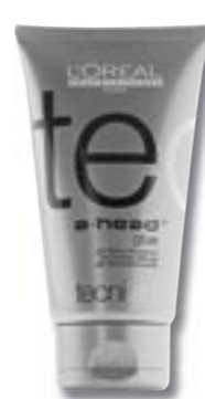
L'Oreal A-Head Glue, £8.95, Saks.

Few men take good enough care of their hands - make people want to hold them.