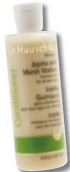
Jojoba and Marshmallow Conditioner, £14, Dr Hauschka, The Dolphin House Shop, 01273 721720.

You're environmentally aware and look for products that are organic, free from harmful ingredients and good for both body and soul.