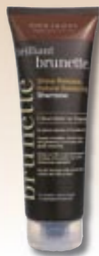
John Frieda's colour enhancing shampoos, for red, brunette and blonde hair, £4.49, Boots.

While your social life is buzzing, your budget is somewhat limited. You need things to spruce up your look for nights on the town without dipping into your beer money.