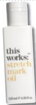
This Works Stretch Mark Oil, £32, mail order 0845 230 0499.