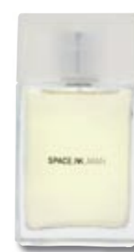
Space NK Eau de Toilette, £50, Space NK.

A cream and cleanser in one from Australian dermatologists. www.skinn.com.au