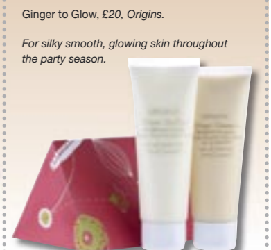
Ginger to Glow, £20, Origins.

For silky smooth, glowing skin throughout the party season.