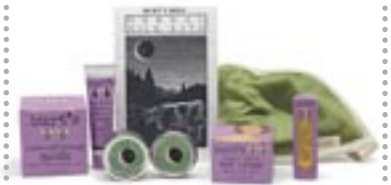
Burt's Bees Queen Bee gift pack, £30, Velvet, 01273 326007.

For a good rest after a day with the kids.