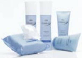
Balancing Facial Range from £3, Marks and Spencer, 01273 328081

No matter how hammered you are at 3am, always cleanse and moisturize!