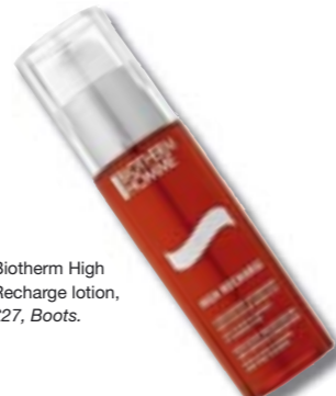
Biotherm High Recharge lotion, £27, Boots.

Leaves sensitive scalps soothed, moisturised and de-stressed, and hair soft and shiny.