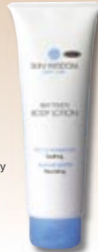
Skin Wisdom Silky Touch Body Lotion, £2.97, Tesco.

No matter how hammered you are at 3am, always cleanse and moisturize!