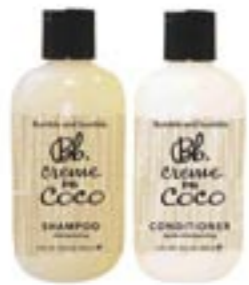
Bumble & Bumble Creme de Coco Shampoo and Conditioner, £16.00 each, Space NK, 01273 776774.

Your body's changed following childbirth and child rearing, and a full night's sleep is a thing of the past. Your pamper time is seriously limited. You need fuss-free, fast-acting yet relaxing products.