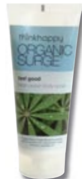
Think Happy Organic surge fresh body scrub, £5.99, Boots.

Made from plant oils, herb and flower extracts, Lavera's Trend Cosmetics are BDIH certified and approved by the