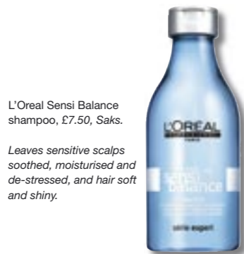
L'Oreal Sensi Balance shampoo, £7.50, Saks.