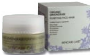
Skincare Café Organic Lemongrass Purifying Face Mask, £10.99, www.asos.com.