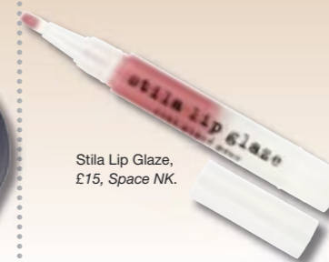
Stila Lip Glaze, £15, Space NK.