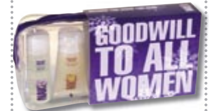
Naked bath gift set, £7, Boots.