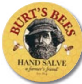
Burt's Bees Hand Salve, £8, Velvet.

Few men take good enough care of their hands - make people want to hold them.