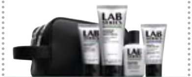
Lab Series Perfect Shave Set, £35, Debenhams.

For your brother, uncle or your partner, Lab Series' travel set comes in a slick case.