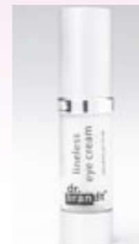
Dr Brandt lineless eye cream, £46, Space NK.