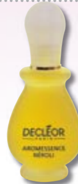
Aromessence Neroli Facial Oil, Decleor, £36, Tranquility Spa at the De Vere Grand, 01273 224341.