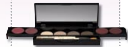
Bobbi Brown Eyes and Lips gift kit, £34, Debenhams, 0844 5616161