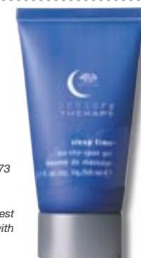
Origins Sleep Time Gel, £14.50, Origins, 01273 773 420

One products that will treat your entire body: face, elbows, hands, legs...