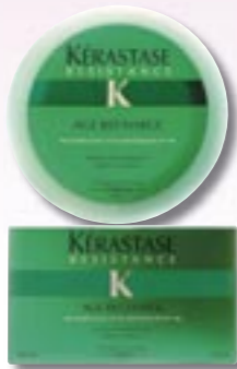
Age Recharge hair masque, Kerastase, £22, Saks, 01273 202088.

You're a young professional with a fine disposable income. You like to look good for work and play, and can afford to spend a little time looking after your body. As well as products that will beautify you for a night out, you also need things to help you unwind after work.