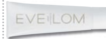
Eve Lom Crème Universalle, £25, Space NK.