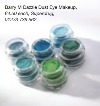
Barry M Dazzle Dust Eye Makeup, £4.50 each, Superdrug, 01273 739 562.