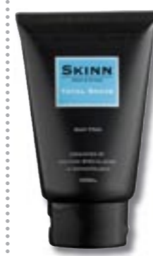
Skinn Total Shave, £32, Harvey Nichols, 020 7235 5000.

Ok, so it's not makeup but this firm hold gel does allow you to sculpt your hair into whatever style you wish.