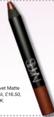
Nars Velvet Matte Lip Pencil, £16.50, Space NK.