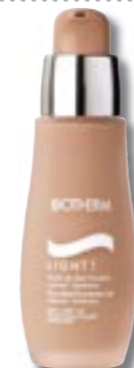
Biotherm Light foundation, £18, Boots, 01273 207461