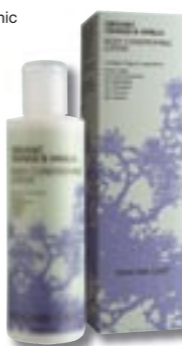
Skincare Café Organic Orange and Vanilla Body Conditioning Lotion, £16.99, www.asos.com.

This range of entirely organic products are ideal for those who want to reduce the chemical and toxic load they are exposed to on a daily basis.