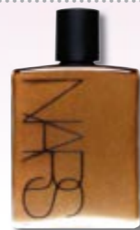
Nars Body Glow, £43, Space NK.