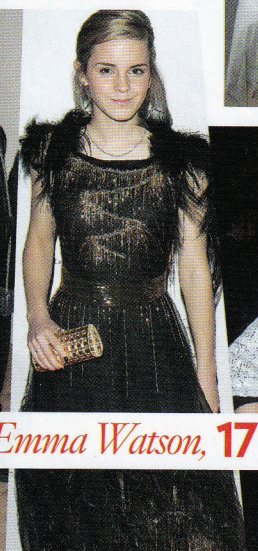
Emma Watson, 17