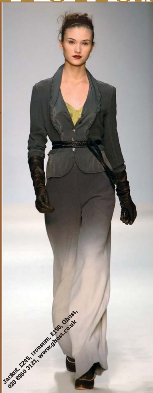
Jacket, £245, trousers, £150, Ghost, 020 8960 3121, www.ghost.co.uk

For those who favour a softer, more overtly feminine look Temperley, Valentino and Ghost have paired sheer blouses and intricate detailing with high waist pants, accentuating the waist and creating a longer leg. Moschino's sleeveless shirt goes beautifully with a pencil skirt, while its ruffle and bow blouse adds a soft touch to straight trousers and braces. By autumn this look will be ubiquitous throughout office blocks and social scenes alike. Paco Rabanne has a similar blouse, which is delicately paired with a pencil skirt. And with rumours of the demise of the label Paco Rabanne, this is surely a key buy for posterity's sake.