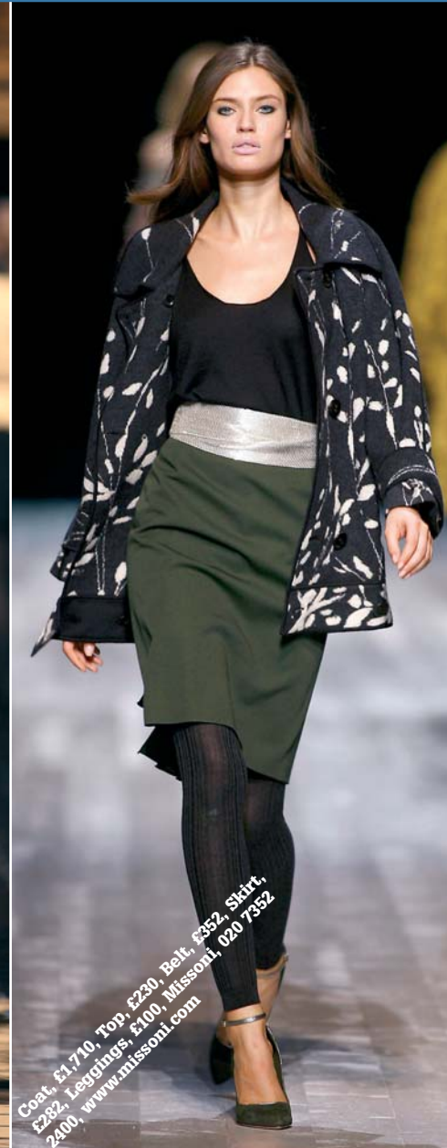
Coat, £1,710, Top, £220, Belt, £352, Skirt, £282, Leggings, £100, Missoni, 020 7332 2400, www.missoni.com