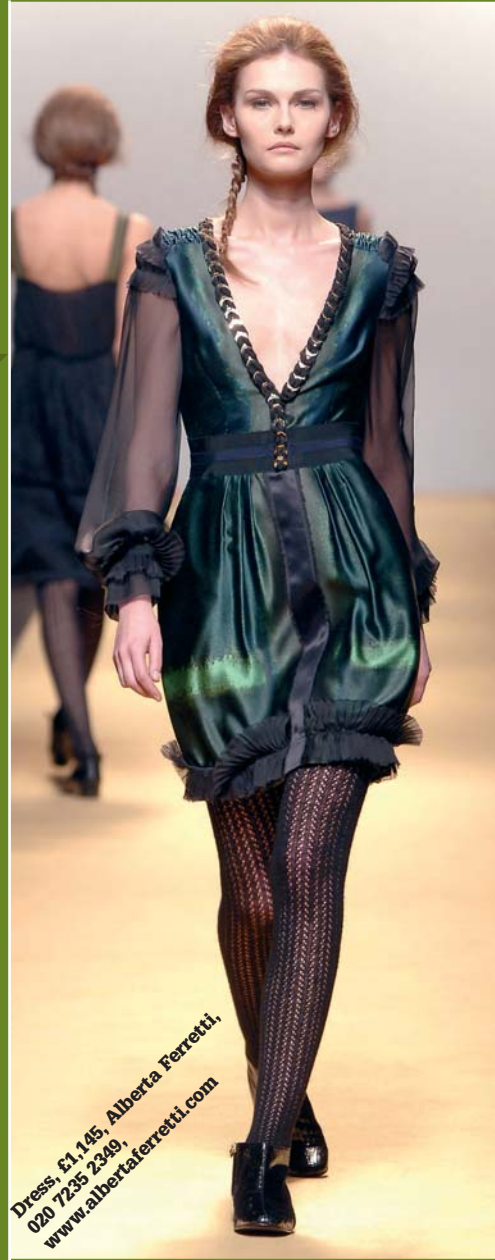
Dress, £1,145, Alberta Ferretti, 020 7235 2349, www.albertaferretti.com

Velvet remains a staple of the winter wardrobe, but this year fabrics like taffeta and brocade add considerable worth to the simplest of designs. Think precious metals, opulent gold and a little shimmer. Paul Smith, Prada, Alberta Ferretti, Burberry Prorsum and Roberto Cavalli go all-out glam with the most sumptuous of fabrics, while Missoni and Amanda Wakeley keep the ornamentation to a minimum with elegant gilt detailing. In terms of colour, grey was arguably the most pervasive colour at the shows. However, at this time of year it can be exceptionally drab and dreary. For a warmer colour and sexier expression than the difficult-to-wear tartans, also seen on the catwalk, green is a far more flattering. Not necessarily the apples and limes which were so popular last year but darker, more seductive emerald as seen at Gharani Strok, Basso and Brook, Celine and Alberta Ferretti.