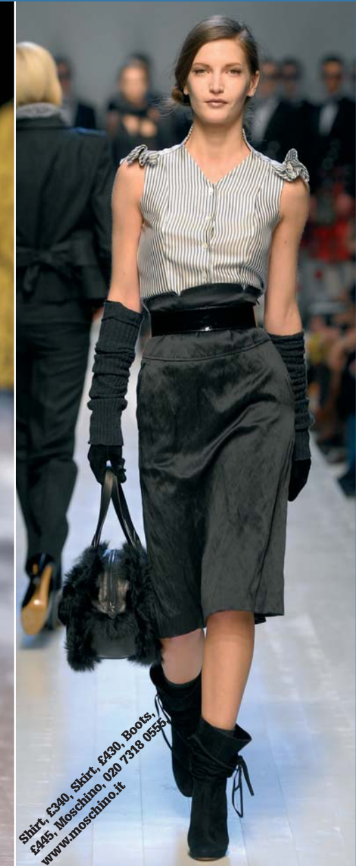
Shirt, £340, Skirt, £430, Boots, £445, Moschino, 020 7318 0535, www.moschino.it