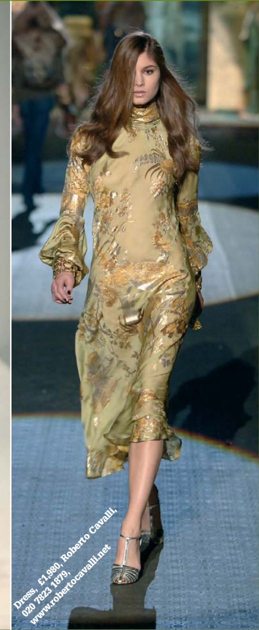
Dress, £1,980, Roberto Cavalli, 020 7822 1879, www.robertocavalli.net