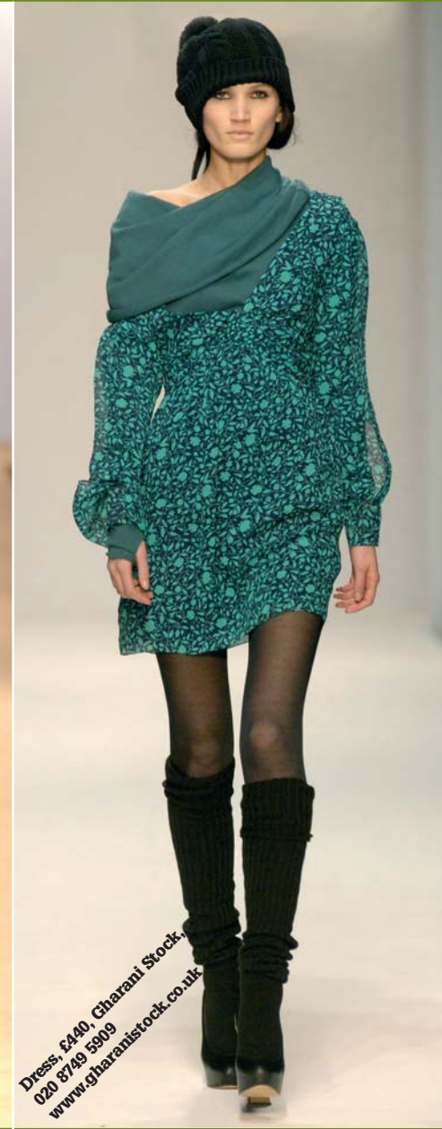
Dress, £440, Gharani Strok, 020 8749 5909 www.gharanistock.co.uk