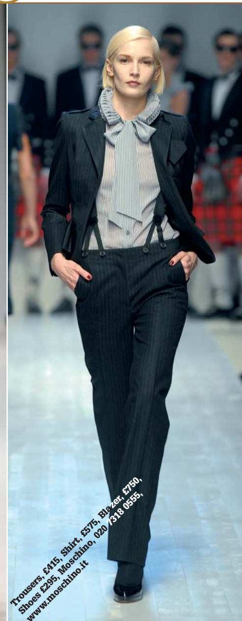
Trousers, £415, Shirt, £375, Blazer, £750, Shoes £295, Moschino, 020 7318 0535, www.moschino.it