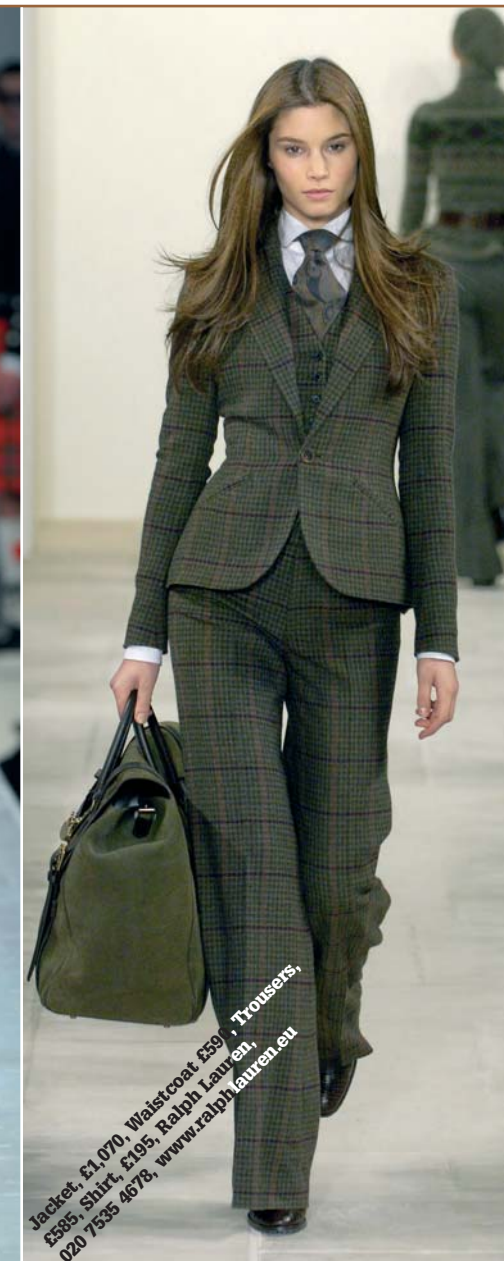
Jacket, £1,070, Waistcoat £59, £585, Shirt, £195, Ralph Lauren, 020 7535 4678, www.ralphlauren.eu